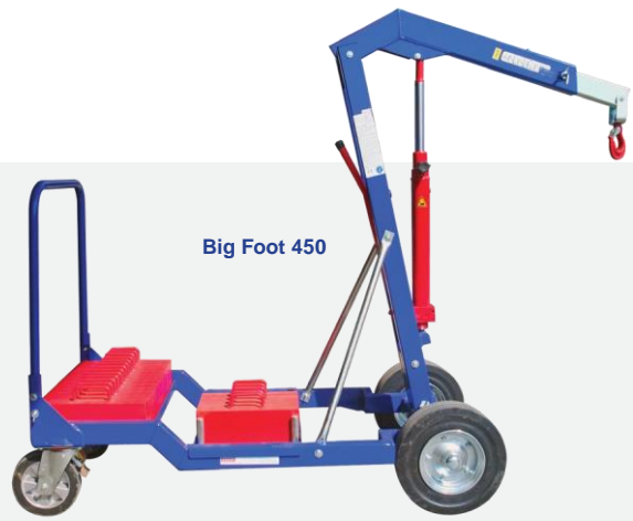
Big Foot 450