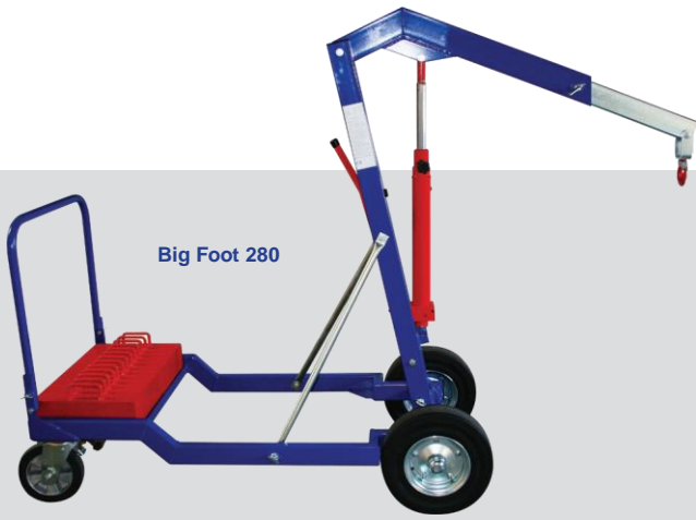
Big Foot 280